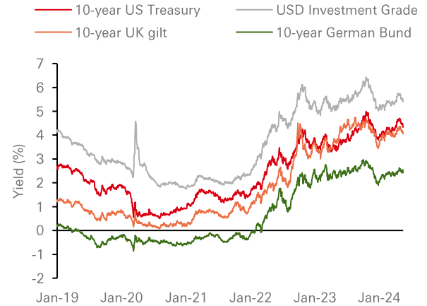
Chart 1: The prospect of rate cuts has caused yields to peak and drives more investors to lock them in

Past performance is not a reliable indicator for future performance.